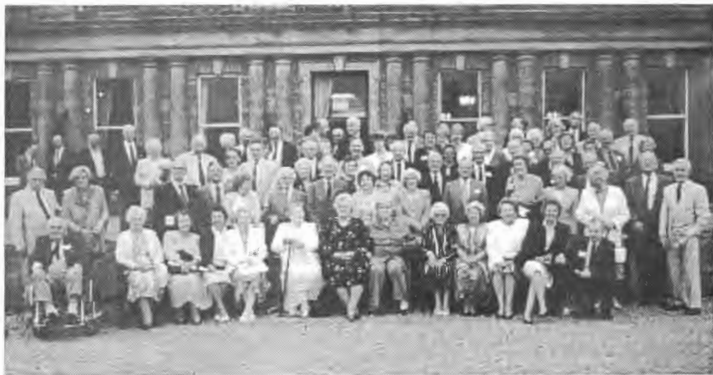
Below and far right The Retired Governors Garden Party 1995